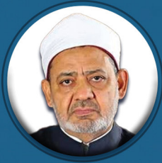
Prof. Ahmed El-Tayeb Grand Emam Sheikh Al-Azhar